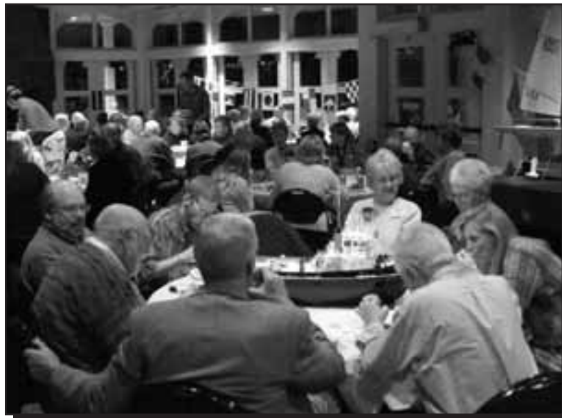
The big hall was full of tables that each had a model as a centerpiece.