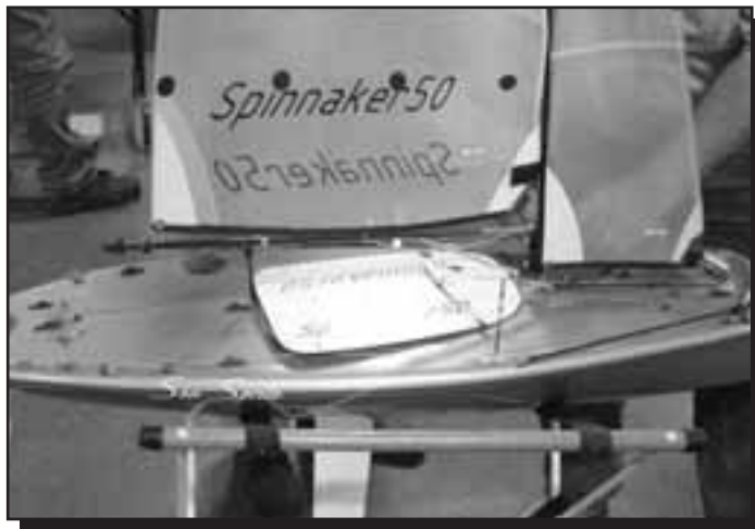
One of the more interesting items for sale at the Swap Meet.