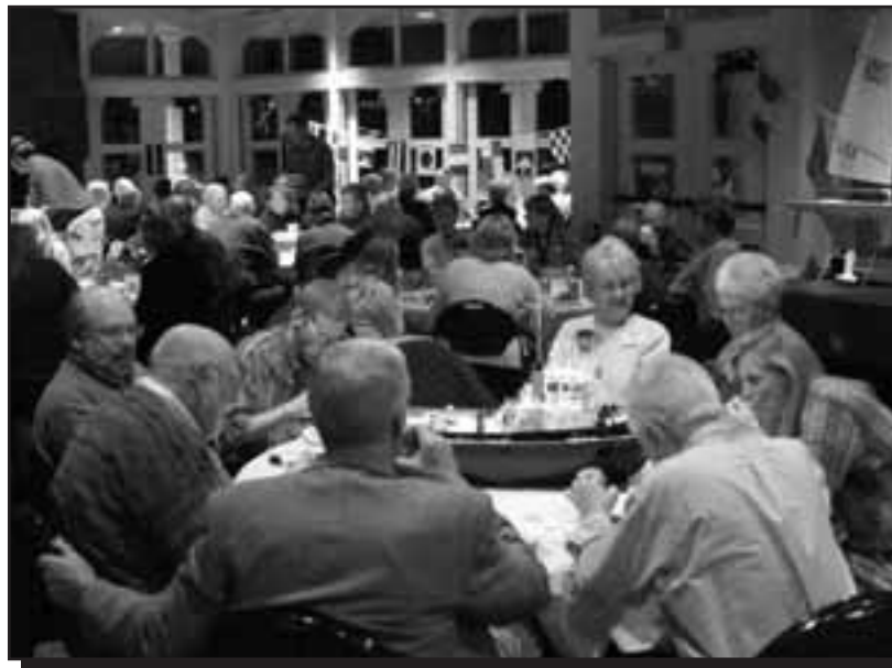
The big hall was full of tables that each had a model as a centerpiece.