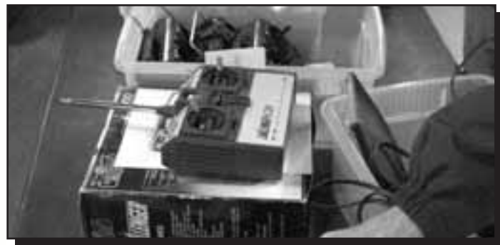
An example of the old radios for sale.