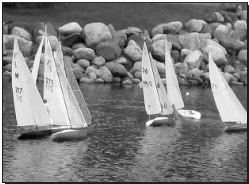
Great turnout! Six of the eleven Fairwinds turning the buoy.

Morning racing started around 10:00 with lunch at 11:30