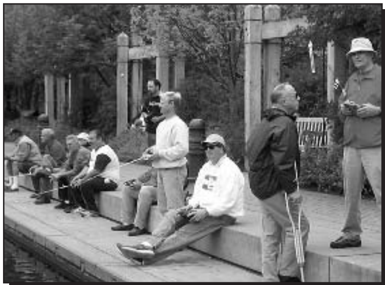
Skippers line the west edge of the center pond in the afternoon.

(that's when the air died). Winds came back in the afternoon and racing continued from about 12:30 to 3:00.