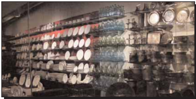
Some of the thousands of dishes, glasses & tableware salvaged from the Arabia