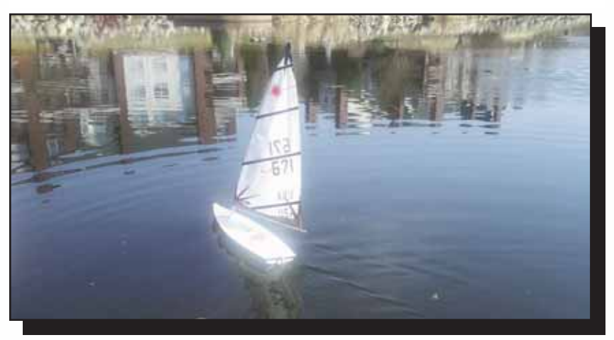
First in the pond, 2:35pm March 14, 2012