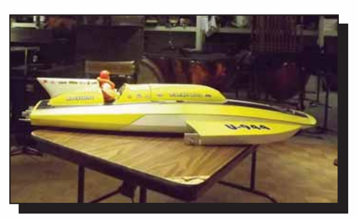
Joe Steele's new racing boat "Moonshine"