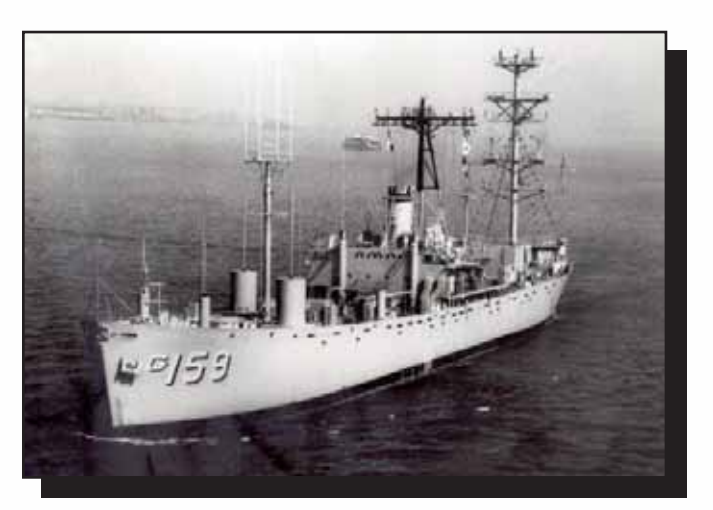
USS Oxford at Guantanamo Bay, Cuba