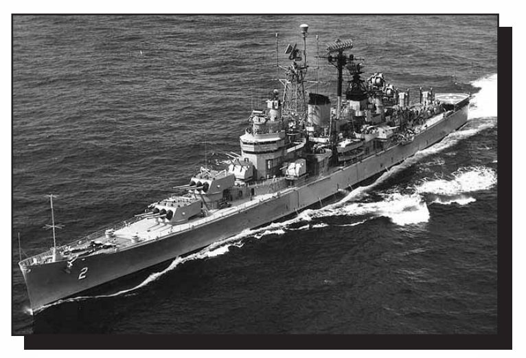
USS Canberra underway near Cuba