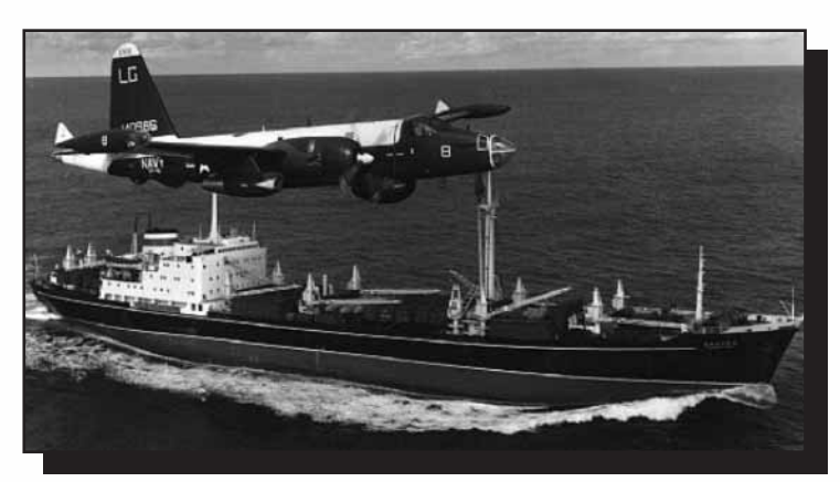
P-2H Neptune flying over Soviet freighter