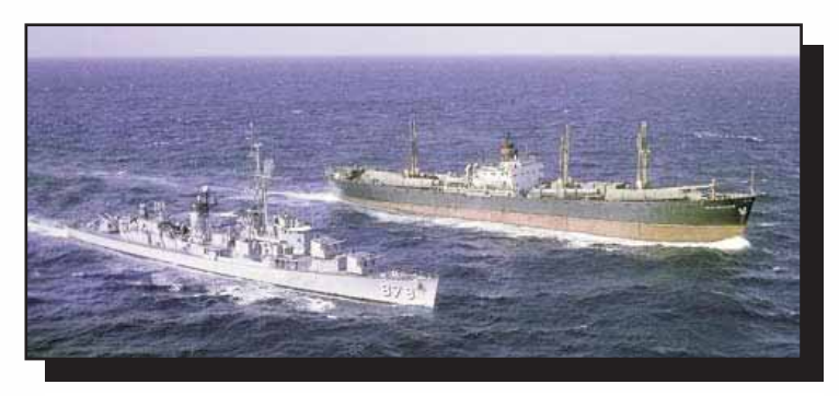
USS Vesole alongside Soviet freighter Polzunov