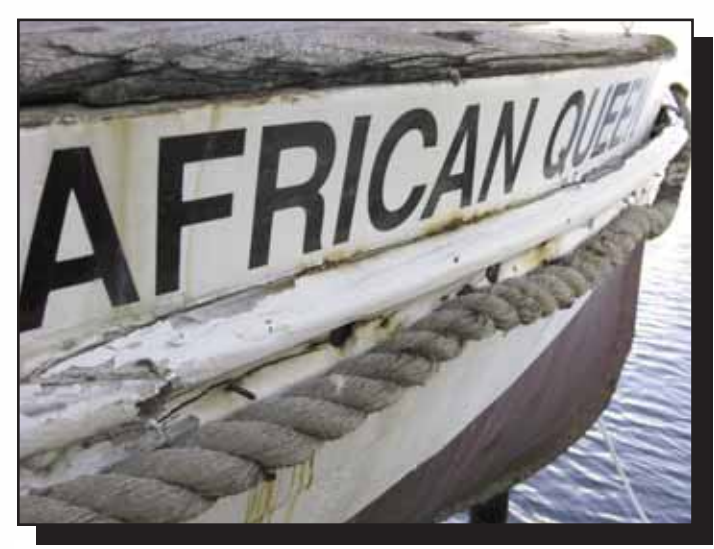
The hull was repaired and reinforced

passed away however, the vessel once more fell upon hard times, wasting away on a lonely jetty in southern Florida.