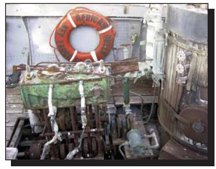
The original boiler had to be replaced

she was used to transport a mixture of big game hunters, mercenaries and cargo.