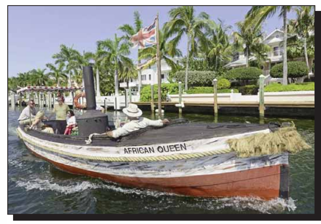
The African Queen, now fully restored and ready for excursions

he African Queen, the historic vessel from Humphrey Bogart's only Oscar winning performance, has been resurrected and restored by a movie-loving Florida couple. The 100-year-old steam boat, named