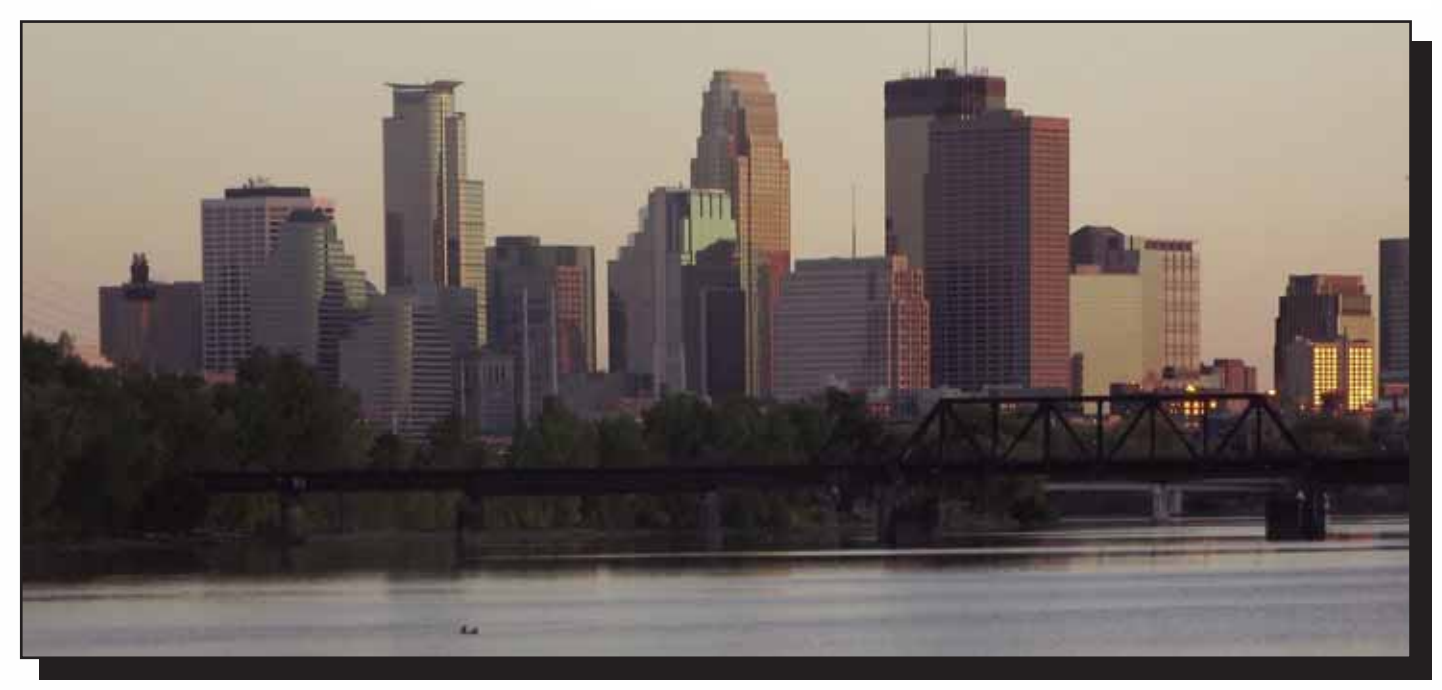
Downtown Minneapolis skyline from the Minneapolis Queen riverboat

of the upper reach of the Mississippi River. To say the weather was favorable would be a huge understatement. The conditions could not have been better. With 125-person capacity we couldn't quite fill up the boat and shared the voyage with a group of Red Hat ladies (what do they do in this club anyway?) (continued on page 4)