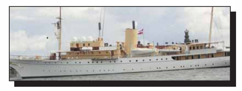
The Royal Yacht Dannenberg

The Royal Yacht Dannenberg was also observed in the Copenhagen Harbor. As of February 2013 this 259 ft.