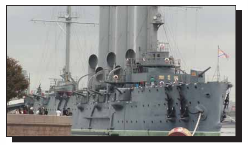
The Aurora, an armored cruiser