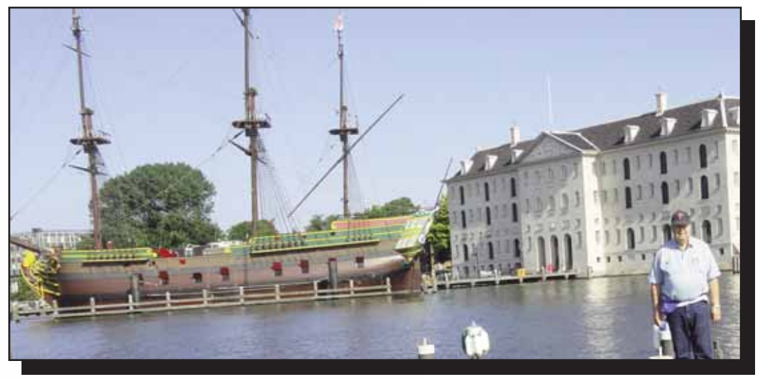
The Amsterdam, an 18th century trading ship