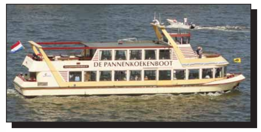
The De Pannekoekenboot cruise boat

private boats of just about any description. One of the most common types