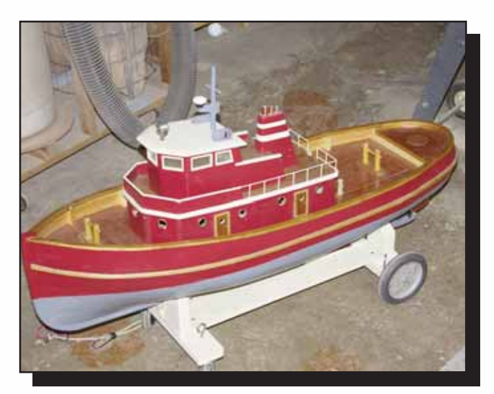
Tugboat is based on photo at left

PROGRESS ON MY TUGBOATS <u>by Bill Uhl</u>