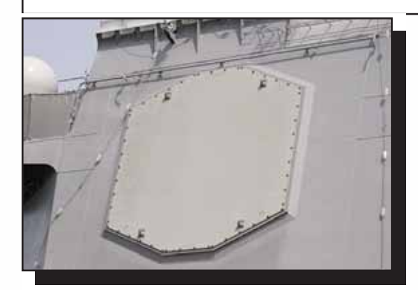
The AN/SPY-1D phased array radar