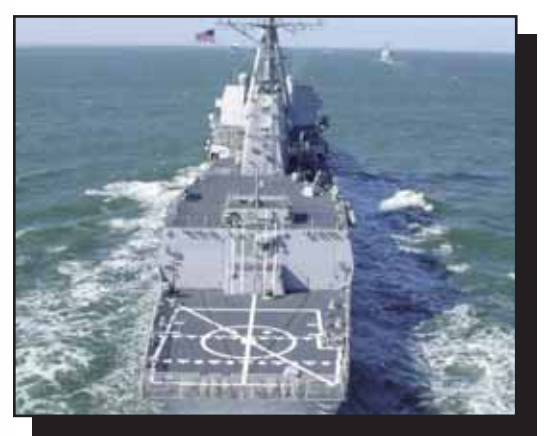
Two helicopter hangars at landing pad

resent many new approaches in naval ship design even compared to destroyers from a decade earlier. One of the most obvious changes from earlier destroyer designs is its wider hull shape. Operational experiences of the Burke class confirm the advantages of this new design. Besides it's unique hull shape the Burke class also incorporates other significant changes in naval architecture, one being a return to steel construction. Destroyers of WWII were made of steel. By the 1960's & 1970's, steel was being replaced by aluminum. A collision off the coast of Sicily in a November 1975 storm between the USS Belknap the USS John F. Kennedy caused a major fire on the USS Belknap and melted the aluminum superstructure to the deck level. This pushed the Navy to pursue an all-steel construction once again.