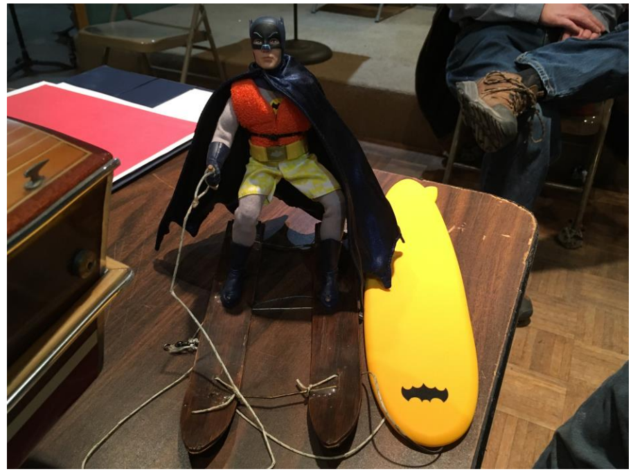
Batman's cape will stick straight out behind him for proper effect when being towed by Svengoolie.