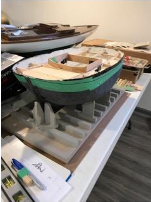
Plug removed and display stand built....