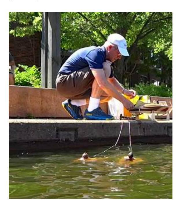
On the water!