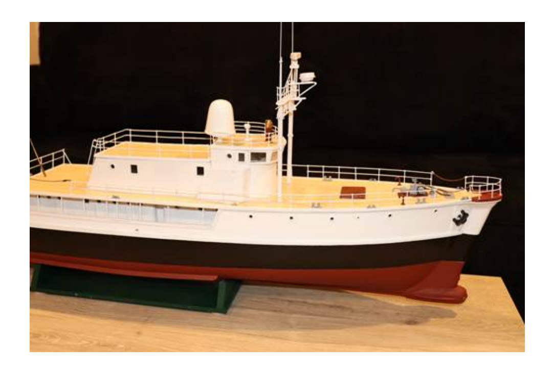
Next is a SeaWind Tim is resurrecting from Larry Covin: