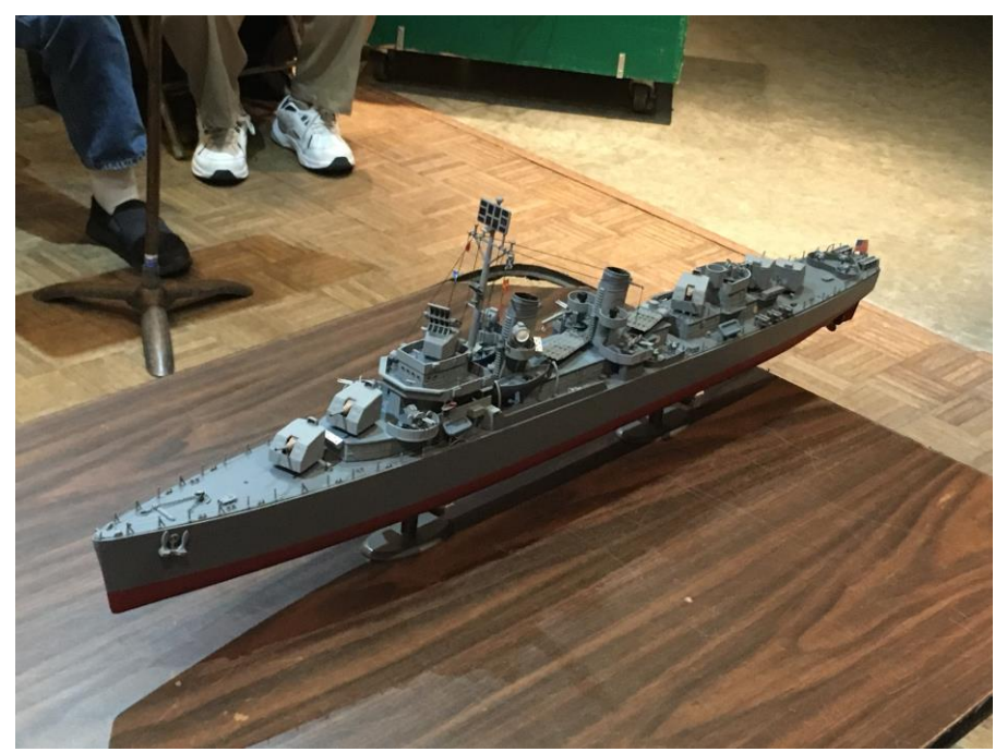
The boat has some very interesting features and lots of details. Look closely between the forward guns: