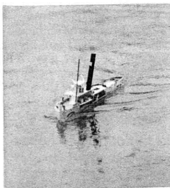
What's Wrong With This Boat?