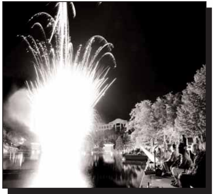
The highlight of the evening was hearing the First John Philip Sousa Memorial band with fireworks.